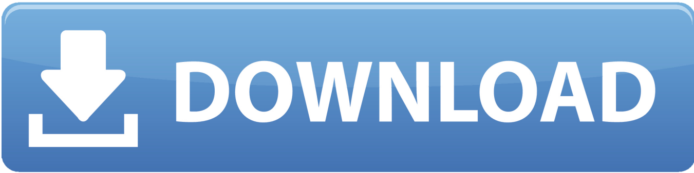
Arnold 2013 Herunterladen Riss 64 Bits DE